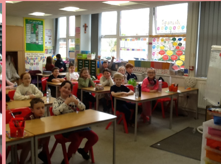
Year 4 children had lots of fun watching a film, playing bingo and enjoying some treats from the PTA tuck shop!