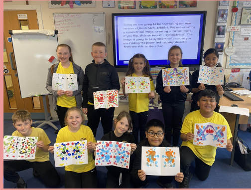
Superb artwork created by the children in 5KN this week in the 'Every Picture Tells a Story' topic.