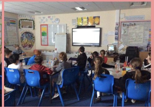
The children in Year 5 enjoying their non uniform day on Tuesday! They played bingo, had snacks from the tuck shop and finished the day with a film all thanks to the PTA.