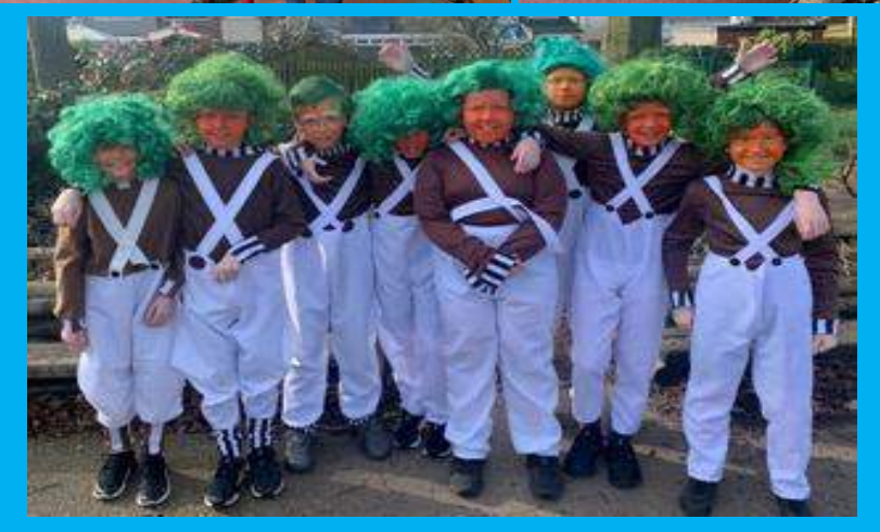
The Oompa- Loompas