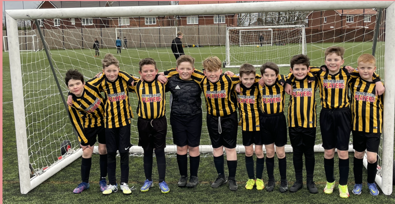
Year 5 boys Football Team at the EFC Knowsley Tournament.