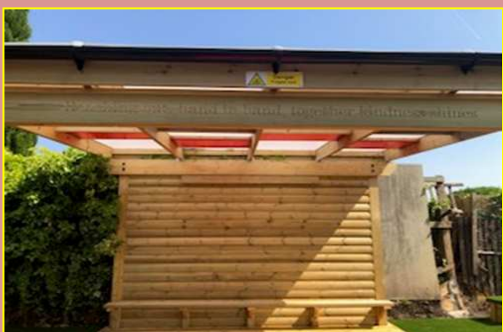
Our Rose Garden at the front of school has also been put in place